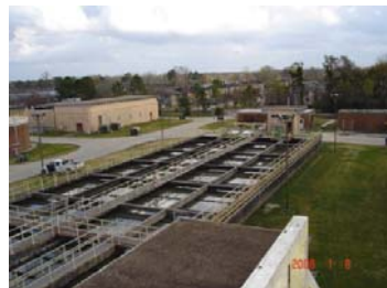
Design of the SWWTP Projects started in November 2008. All three projects are scheduled to be completed by June 2014.