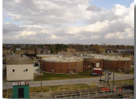
SWWTP: 2850 Gardere Lane, Baton Rouge