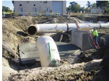
Construction of yard pipe at the SWWTP will convey wastewater throughout the plant.