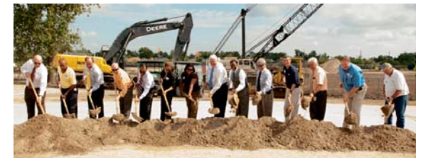
Groundbreaking marks the beginning of construction of Phase 1.

This $113 million Phase 1 Project is the second of three major improvement projects at the South Wastewater Treatment Plant being implemented on an expedited schedule to improve the plant's operational and mechanical reliability. These improvements will enable the plant to accommodate future flows, and as a critical component of the SSO Program, will promote compliance with the plant's effluent discharge permits.