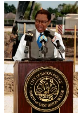
Mayor Holden hosts Phase 1 groundbreaking at the South Wastewater Treatment Plant.

The SSO Program is a comprehensive sewer improvement program designed to meet federal requirements, improve the quality of life for residents, and protect the area's rich natural resources. Positive side benefits of the program are an increased infrastructure capacity to support growth and economic development, and the capacity to build the local disadvantaged business enterprises.