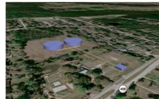
3-D GIS map showing location of proposed storage tanks