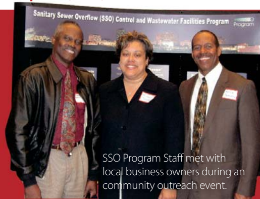
SSO Program Staff met with local business owners during a community outreach event.