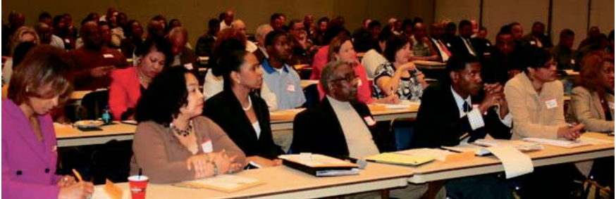
Community leaders and small and disadvantaged business owners attended a seminar in March 2010 sponsored by the Mayor-President's office to encourage and promote local businesses.