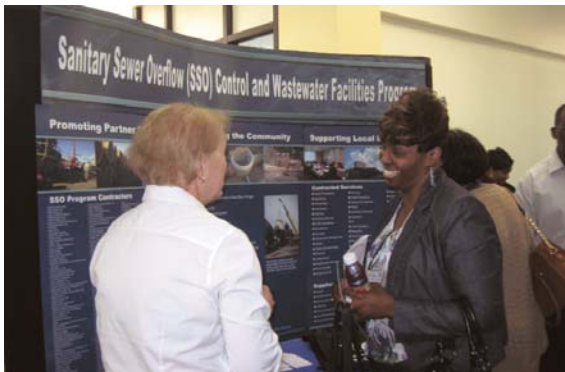
SSO Program staff participated in events promoting small business participation in April and June.

list of current construction projects and project prime contractors was provided along with a fact sheet. SSO Program staff also participated in two small and disadvantaged business networking events, one sponsored by the Mayor-President's office and another by Southern University. Program staff discussed projects and potential collaboration with businesses participating in the events.