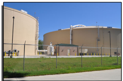
After completion of construction