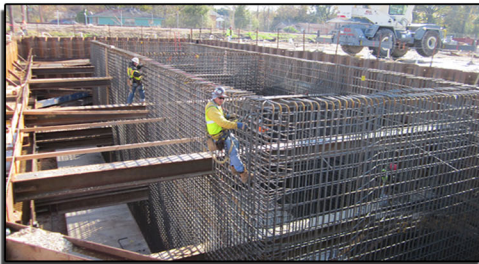
PS 42 is still under construction.

It is expected that the wastewater will begin to be diverted from the CWWTP to the SWWTP in early 2015.