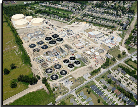
Flow will be redirected to the SWWTP.

Baton Rouge is gaining attention as one of America's next great cities. To allow for continued growth, the City-Parish needs to expand its wastewater collection and treatment infrastructure. Expanding the South Wastewater Treatment Plant (SWWTP) and increasing the plant's treatment capacity is one of the main components of the SSO Program. The expansion of the SWWTP will allow the closure of the Central Wastewater Treatment Plant (CWWTP) thereby reducing the overall long term cost to the maintenance and operation of the sewer system. The upgraded SWWTP will also help bring the City-Parish into compliance with discharge permits.