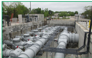
Valve vault piping at pump station 514