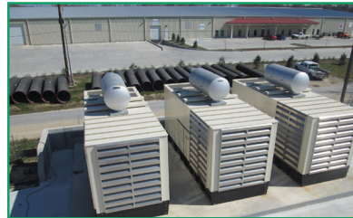
Generators at pump station 514