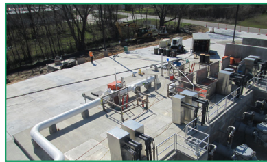
Odor control and electrical controls at pump station 514