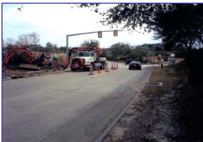
Near PS382, trucks are used to ensure proper care is taken by the contractor when by-pass pumping started on the existing lift station.