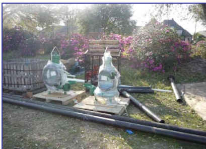
A new submersible pump, still wrapped from the factory, is ready for installation into the newly resurfaced, rehabilitated wet well.