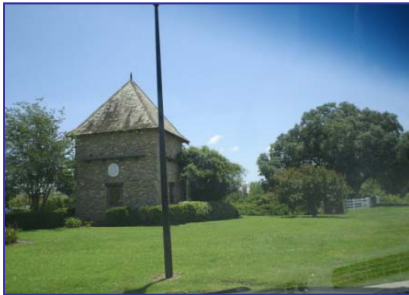
The Kleinpeter Area Upgrade project consists of 2000 feet of forcemain upgrades.

This project is located in the Santa Maria Golf Club/Country Club of Louisiana area near Interstate 10 and Highland Road. Capacity upgrades were made to PS382 and approximately 2,000 linear feet of new 6-inch forcemain was constructed. By increasing the forcemain size from 4 to 6 inches, this pump station will have approximately 40% increase in pumping capacity.