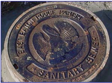
One of the first steps in rehabilitation includes a physical inspection of manholes and pipes to identify blockages.