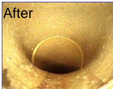
Simply cleaning the pipes and manholes in preparation for the physical inspection removes blockages, debris and roots.