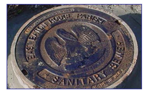
One of the first steps in rehabilitation includes a physical inspection of manholes and pipes to identify blockages.

Rehabilitation of the sewer collection system is a comprehensive physical process that begins with cleaning and inspection of sewer pipes and manholes. Typical rehabilitation repairs include pipe and manhole replacement and trenchless technologies that minimize above ground disturbances, such as cured-in-place pipe liners.