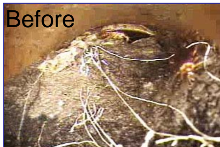
Simply cleaning the pipes and manholes in preparation for the physical inspection removes blockages, debris and roots.