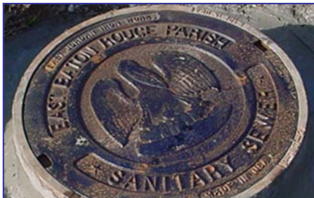
One of the first steps in rehabilitation includes a physical inspection of manholes and pipes to identify blockages.

Rehabilitation of the sewer collection system is a comprehensive physical process that begins with cleaning and inspection of sewer pipes and manholes. Typical rehabilitation repairs include pipe and manhole replacement and trenchless technologies that minimize above ground disturbances, such as cured-in-place pipe liners.