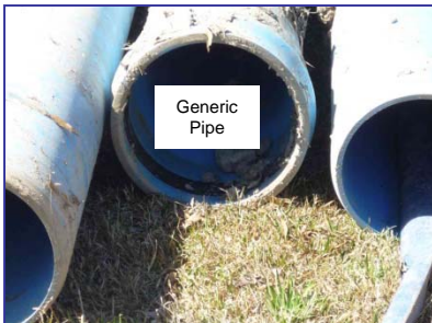
Approximately 7,360 linear feet of 16-inch force main will be constructed in the project area.