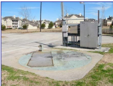
PS119, located on Citiplace Drive near the Movie Theater, will be upgraded.