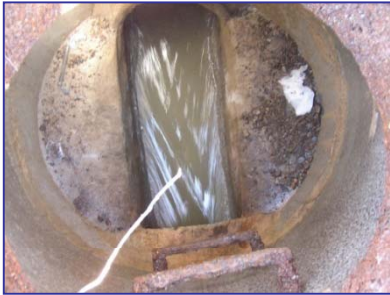
Design of the Citiplace-Essen-PS119 project started in February 2008.

The SGC-C-PS119 (Citiplace/Essen Area PS119 and Force main Improvements) project includes the construction of both 7,360 feet of new 16-inch force main from PS119 to PS 58 and the upgrade of PS119 due to the longer force main and the predicted increase in future peak wet weather flow.