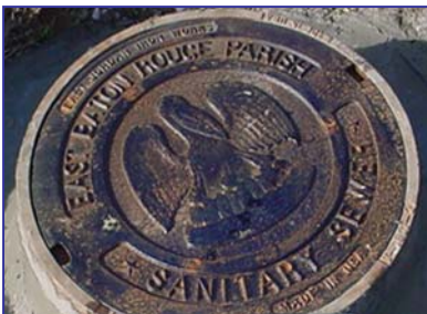
One of the first steps in rehabilitation includes a physical inspection of manholes and pipes to identify blockages.

Rehabilitation of the sewer collection system is a comprehensive physical process that begins with cleaning and inspection of sewer pipes and manholes. Typical rehabilitation repairs include pipe and manhole replacement and trenchless technologies that minimize above ground disturbances, such as cured-in-place pipe liners.