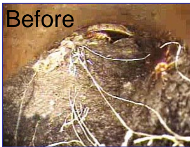
Simply cleaning the pipes and manholes in preparation for the physical inspection removes blockages, debris and roots.