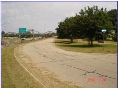
The design of Group 1B project consists of upgrading approximately 35,330 linear feet of force main