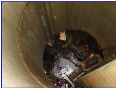
PS35 (located off of Maplewood Dr, between East Fairlane Ct and Flag St) will be upgraded to increase capacity.