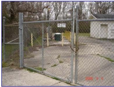
A new 8-inch force main will be installed starting at PS277 (located east of the end of Wright Drive) and will run north for 3,124 feet.