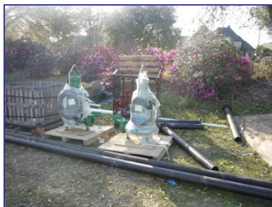
New submersible pumps wrapped from the factory and ready for installation into wet wells.