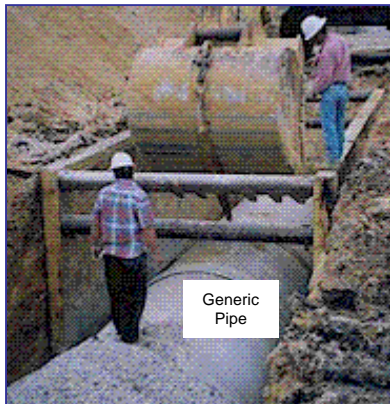
Collection system pipe sizes range from less than a foot to over six feet in diameter.