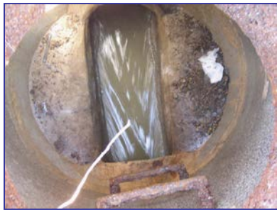
Flow measurements are taken throughout the collection system to determine the correct pipeline size.