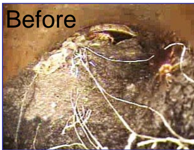
Simply cleaning the pipes and manholes in preparation for the physical inspection removes blockages, debris and roots.