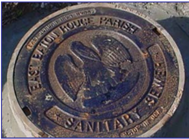
One of the first steps in rehabilitation includes a physical inspection of manholes and pipes to identify blockages.

Rehabilitation of the sewer collection system is a comprehensive physical process that begins with cleaning and inspection of sewer pipes and manholes. Typical rehabilitation repairs include pipe and manhole replacement and trenchless technologies that minimize above ground disturbances, such as cured-in-place pipe liners.