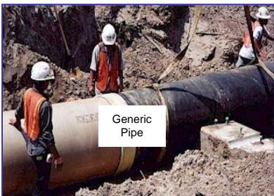
A total of 32,420 linear feet of various sizes of force main will be upgraded in the project area.