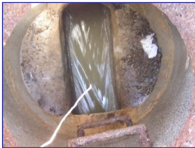
Flow measurements are taken throughout the collection system to determine the correct pump station upgrade size.

The project involves the design and construction of force main upgrades in the North Forced West Basin. The upgrades are designed to alleviate chronic SSOs at the pump stations and increase the force main capacity. The upgrades range in size from 4 to 24-inch diameter.