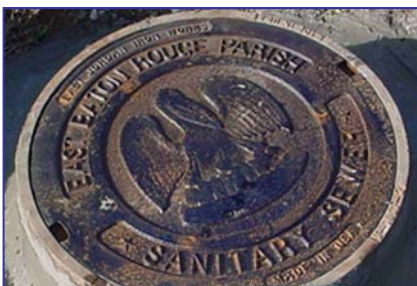
One of the first steps in rehabilitation includes a physical inspection of manholes and pipes to identify blockages.

Rehabilitation of the sewer collection system is a comprehensive physical process that begins with cleaning and inspection of sewer pipes and manholes. Typical rehabilitation repairs include pipe and manhole replacement and trenchless technologies that minimize above ground disturbances, such as cured-in-place pipe liners.