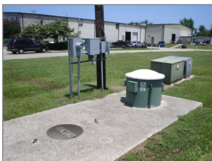
Pump station 287 was demolished and replaced with new pump station 332.