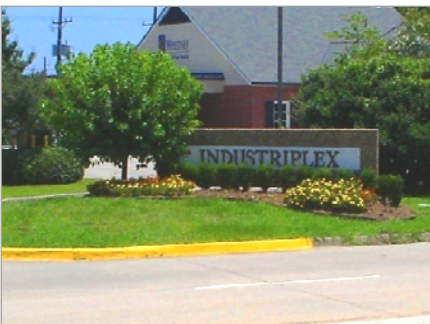
Six pump stations will be demolished in the Industriplex area.