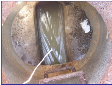
Once complete, SSOs at PS58 will be reduced.