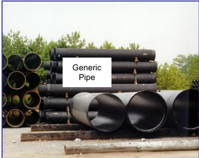
New forcemain will be constructed in the project area.