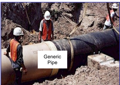
60-inch diameter forcemain will be installed in the project area.