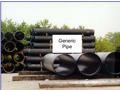
Approximately 970 linear feet of new 36-inch gravity main will be constructed in the project area.