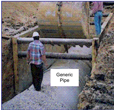
Collection system pipe sizes range from less than a foot to over three feet in diameter..

The Bayou Duplantier Area Sewer Upgrades project includes upsizing of gravity sewer segments in the area of Perkins Road and Bayou Duplantier. These improvements are being made to alleviate upstream SSOs.