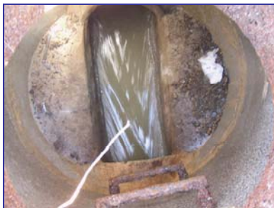
Flow measurements are taken throughout the collection system to determine the correct pipeline size