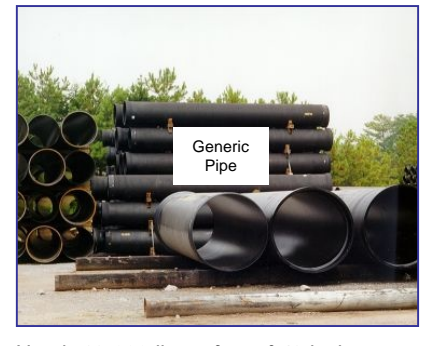
Nearly 32,000 linear feet of 48 inch diameter force main will be constructed in Phase 3 of the project.